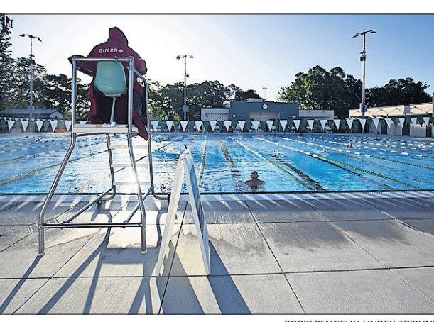
ROBBI PENGELLY / INDEX-TRIBUNE